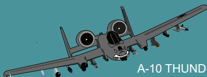
A-10 THUNDERBOLT II