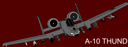
A-10 THUNDERBOLT II