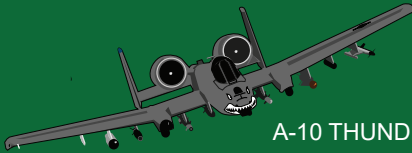
A-10 THUNDERBOLT II